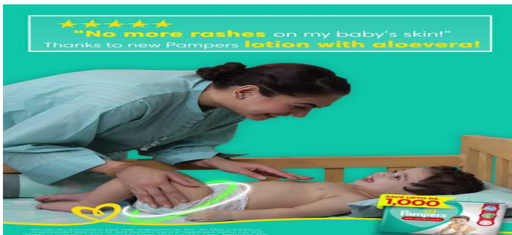
Figure 4.3: An ideal mother

In order to maintain traditional gender norms, this advertisement features a woman as a mother laughing with her child in a tidy setting. A picture of the mother and child smiling lovingly at each other adds emotional depth, suggesting a caring and loving relationship. The mother emphasizes her caring role by being fully available and involved with her child. The child's calm attitude is remarkable; his carefree face and gaze imply a sense of trust and peace. The absence of a father figure reinforces a gendered division of labor by implying that caring for children is exclusively the responsibility of women. However, it is important that taking care of children is a role that society expects and dictates to women rather than something that women are naturally obligated to do. This depiction obscures the possibility of shared duties and more inclusive parenting models, restricting our awareness of different family dynamics and reinforcing cultural expectations surrounding women's roles in children.