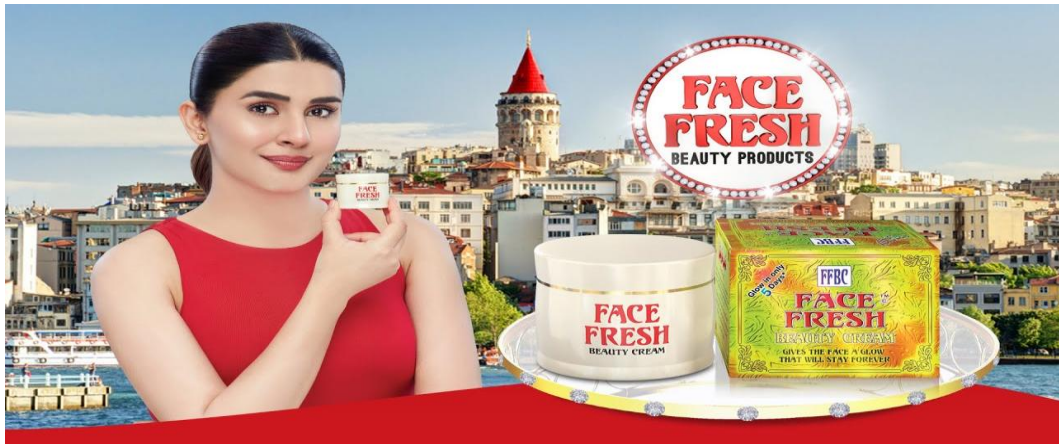
Figure 4.7: Woman as a symbol for objects

This commercial reinforces the damaging stereotype that white skin is attractive. The advertising uses the gorgeous female figure as a marketing technique to promote the item. This advertisement features a model wearing revealing clothing, purposefully exposing various body parts to draw viewers. The model's perfect physique and attractiveness in the advertisement promote destructive beauty standards by suggesting that achievement and contentment depend on having a particular physical look. Red is frequently linked to ardor, love, and allure; her outfit gives the commercial a dynamic edge and increases its eye-catching quality. The commercial adds to the cultural pressure placed on people—women in particular—to meet unattainable beauty standards. In this advertisement, a city denotes riches and power, evoking sentiments of achievement, luxury, and aspiration while positioning the item as an expensive quality.