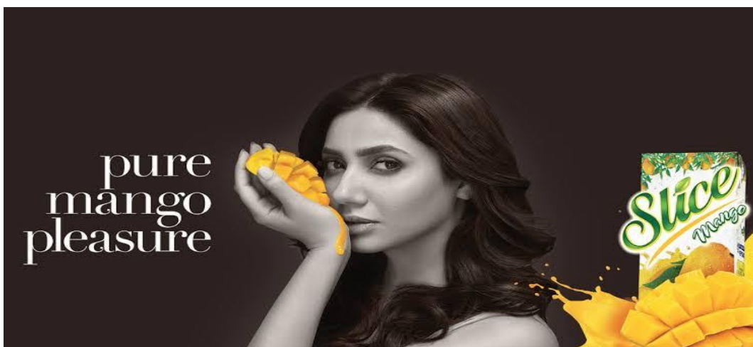
Figure 4.8: The sex object stereotype

This commercial reinforces the damaging stereotype that white skin is attractive. The advertising uses the gorgeous female figure as a marketing technique to promote the item. This advertisement features a model wearing revealing clothing, purposefully exposing various body parts to draw viewers. The model's perfect physique and attractiveness in the advertisement promote destructive beauty standards by suggesting that achievement and contentment depend on having a particular physical look. Red is frequently linked to ardor, love, and allure; her outfit gives the commercial a dynamic edge and increases its eye-catching quality. The commercial adds to the cultural pressure placed on people—women in particular—to meet unattainable beauty standards. In this advertisement, a city denotes riches and power, evoking sentiments of achievement, luxury, and aspiration while positioning the item as an expensive quality.