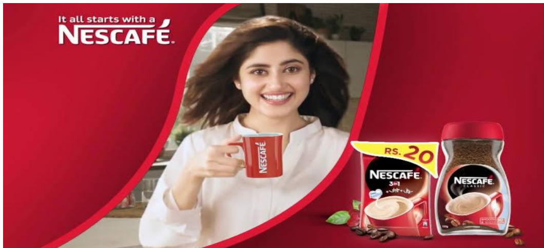
Figure 4.10: Woman as an object to be used

This advertisement features a celebrity in an appearance that emphasizes her physical attractiveness rather than the advertised product. She purposefully draws the viewer's attention with her flowing hair and alluring smile, emphasizing the product with an air of attraction. This strategy uses the celebrity's charms to draw attention or readers to the product's qualities and advantages. The jam-colored background draws attention to the coffee's rich taste and connects it to sweetness. In contrast, a softly highlighted background that encircles the female model conveys a sense of peace, freshness, and energy. By putting image over content, the advertisement promotes marketing and a culture where people make quick decisions about what to buy. Furthermore, it encourages a culture of unachievable goals by establishing unreasonable expectations about beauty.