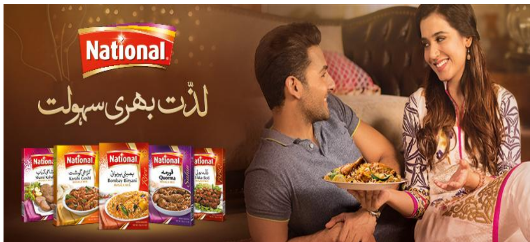
Figure 4. 2: Woman depiction in traditional role

can give rise to new experiences or preferences. The image of a woman giving meals to a man in the advertising maintains traditional gender norms and that women are primarily nurturers and caregivers. By depicting the woman in a submissive role, the advertisement perpetuates detrimental gender stereotypes by suggesting that women are obligated to perform household chores like cooking in order to appease their families, especially their husbands. This representation undermines women's autonomy and individuality by upholding the repressive idea that women's primary duty is to serve men's demands.