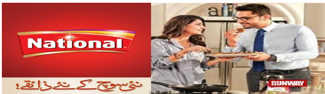
Figure 4. 1: A good wife stereotype

The following five advertisements represent the domesticity and caregiving category, showcasing women in domestic and nurturing roles. These advertisements perpetuate negative gender stereotypes that restrict women's duties to those of caregivers and homemakers. Their widespread usage shapes society's perception of women's duties by upholding patriarchal norms.