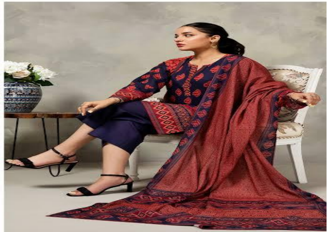
Figure 4.9: Woman as an object to be viewed

A female model is used in this advertisement to promote garments. The way a woman is portrayed in the advertisement objectifies her body by emphasizing the product with her looks. The advertisement showcases an artificially attractive woman who reveals her skin to draw attention. The diversity and complexity of women in our culture are not adequately portrayed in this way. Instead, it takes advantage of women's bodies for corporate gain, promoting negative perceptions of gender and viewing women like inanimate objects. The eye-catching advertisement shouts savings with an amazing 70% OFF, boldly displayed to attract readers' attention.