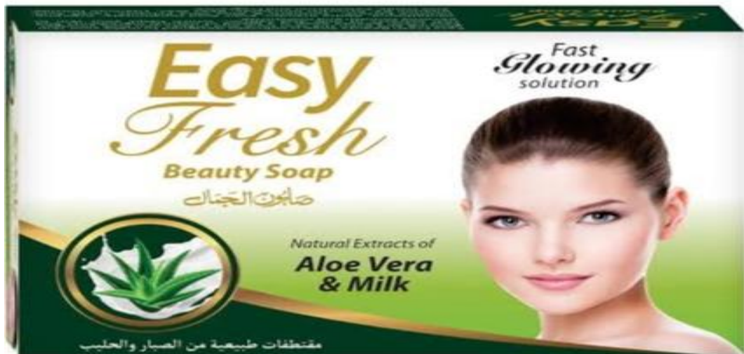
Figure 4.6: Woman as an object of desire

The tagline reinforces the misleading perception that light skin is an ideal beauty standard, "Fast Glowing Solution," which suggests that dark skin tones are an issue that needs to be fixed. By presenting the soap as a solution to this alleged problem, the word "solution" reinforces the notion that people with dark skin tones must have it brightened. The abuse of women's bodies in commercials is best illustrated by the usage of a woman's picture on the soapbox; using a woman's naked body to attract attention supports unfair beauty norms, where a woman is not appreciated as a person with her own opinions and perspectives but rather as an object to market a product.