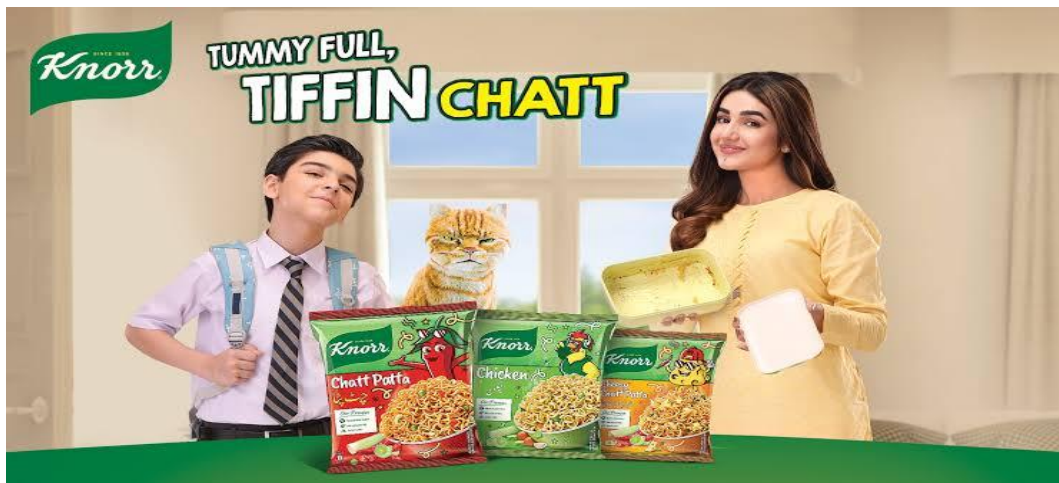
Figure 4.5: Traditional mother role

This commercial shows a mother and her child getting ready for school. The mother holds up an empty lunchbox and displays it to the camera as her child prepares to depart for school wearing his school uniform. This advertisement highlights the worth of mom and the traditional. Pakistanis believe that a mother's role is in a child's education. Women are expected to be able to handle childcare duties and domestic activities. Moms are responsible for getting their kids ready for school and making sure they have a healthy meal. The father's role is frequently missing or subordinate to that of the mother, who is responsible for nurturing and supporting her child's progress and growth.